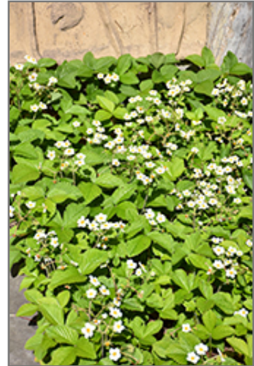
Common Wild Strawberry in bloom

Common Wild Strawberry features dainty white cup-shaped flowers with yellow eyes along the stems from late spring to early summer. Its attractive tomentose round compound leaves remain green in color throughout the season. It features an abundance of magnificent cherry red berries from late spring to late summer.