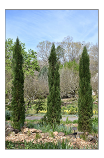
Blue Italian Cypress