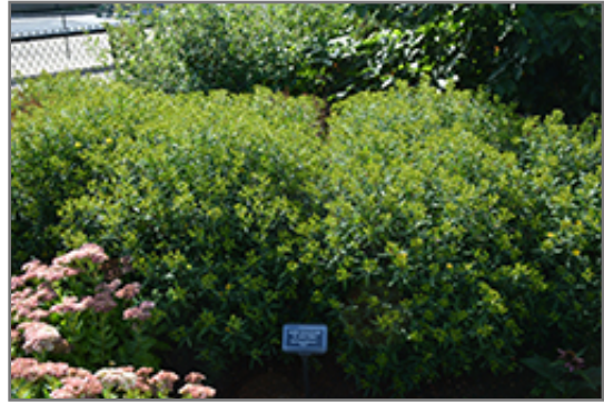
Sunny Boulevard St. John's Wort

Sunny Boulevard St. John's Wort makes a fine choice for the outdoor landscape, but it is also well-suited for use in outdoor pots and containers. With its upright habit of growth, it is best suited for use as a 'thriller' in the 'spiller-thriller-filler' container combination; plant it near the center of the pot, surrounded by smaller plants and those that spill over the edges. It is even sizeable enough that it can be grown alone in a suitable container. Note that when grown in a container, it may not perform exactly as indicated on the tag - this is to be expected. Also note that when growing plants in outdoor containers and baskets, they may require more frequent waterings than they would in the yard or garden.