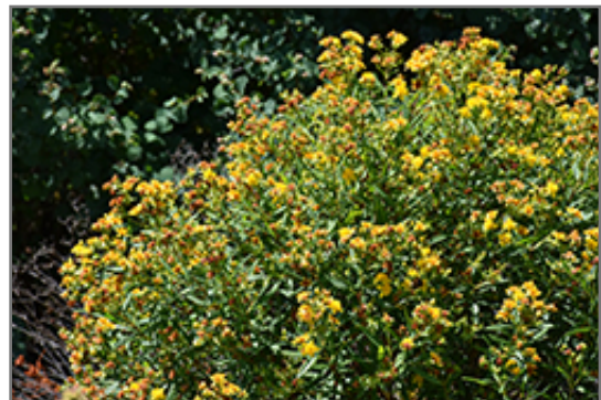
Sunny Boulevard St. John's Wort in bloom