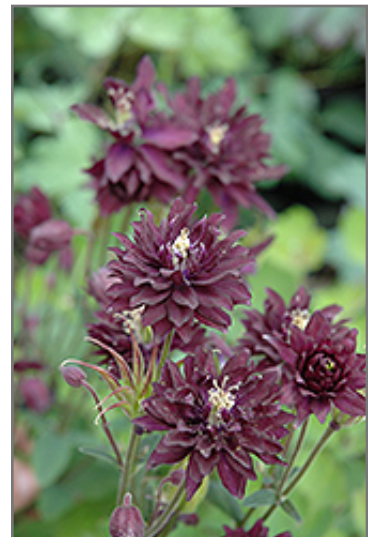
Clementine Dark Purple Columbine flowers