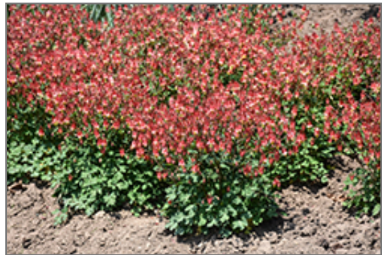
Little Lanterns Columbine in bloom