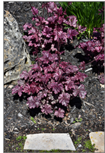
Midnight Rose Coral Bells