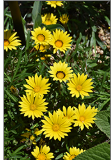
Colorado Gold Gazania flowers

Colorado Gold Gazania is recommended for the following landscape applications;