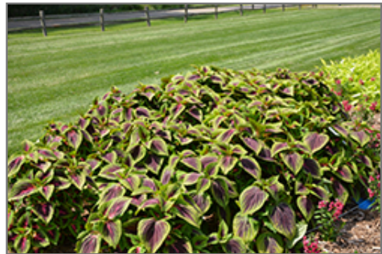
French Quarter Coleus