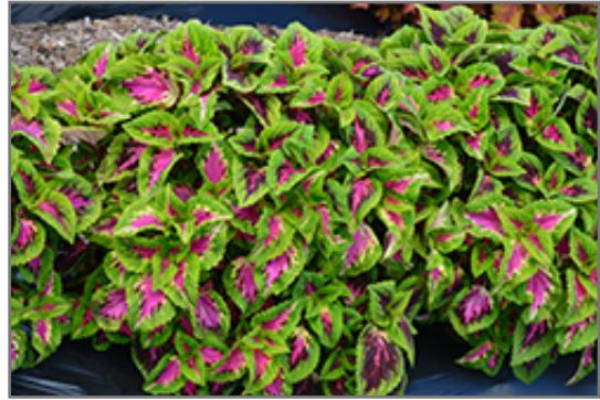
French Quarter Coleus

Although it's not a true annual, this fast-growing plant can be expected to behave as an annual in our climate if left outdoors over the winter, usually needing replacement the following year. As such, gardeners should take into consideration that it will perform differently than it would in its native habitat.