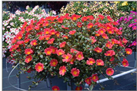
Mega Pazzaz Red Portulaca in bloom