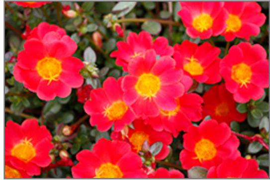
Mega Pazzaz Red Portulaca flowers

This is a relatively low maintenance plant, and should not require much pruning, except when necessary, such as to remove dieback. It is a good choice for attracting butterflies and hummingbirds to your yard, but is not particularly attractive to deer who tend to leave it alone in favor of tastier treats. It has no significant negative characteristics.