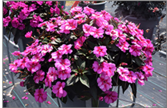
SunPatiens Compact Purple Candy Impatiens in bloom

SunPatiens Compact Purple Candy Impatiens is a fine choice for the garden, but it is also a good selection for planting in outdoor containers and hanging baskets. It can be used either as 'filler' or as a 'thriller' in the 'spiller-thriller-filler' container combination, depending on the height and form of the other plants used in the container planting. It is even sizeable enough that it can be grown alone in a suitable container. Note that when growing plants in outdoor containers and baskets, they may require more frequent waterings than they would in the yard or garden.