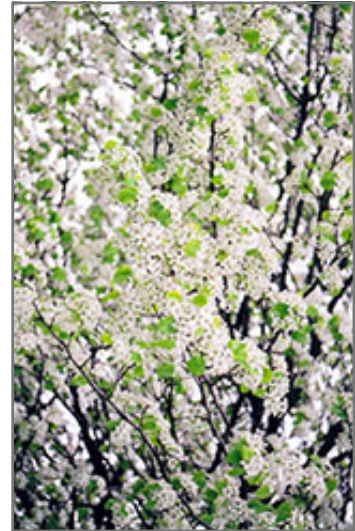
Bradford Ornamental Pear flowers