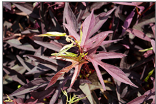
Sweet Caroline Upside Black Coffee Sweet Potato Vine foliage