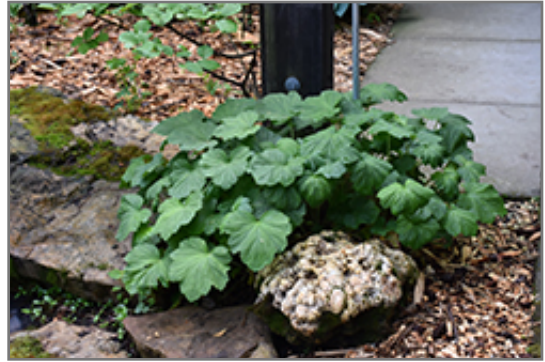
Coral Bells

Coral Bells is recommended for the following landscape applications;