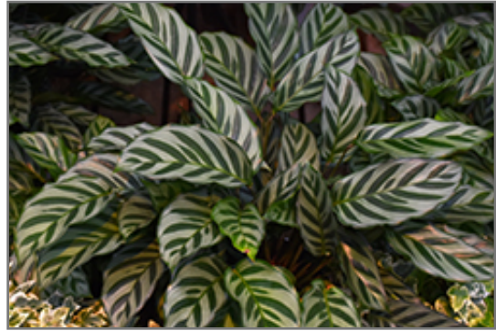
Color Full Makoyana Peacock Plant foliage

This is an herbaceous houseplant with an upright spreading habit of growth. Its relatively coarse texture stands it apart from other indoor plants with finer foliage. This plant should not require much pruning, except when necessary to keep it looking its best.