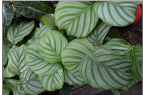
Color Full Orbifolia Prayer Plant foliage