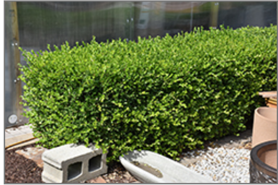
NewGen Independence Boxwood