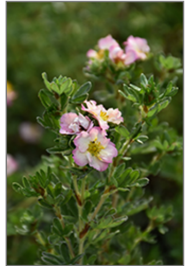
Happy Face Hearts Potentilla flowers