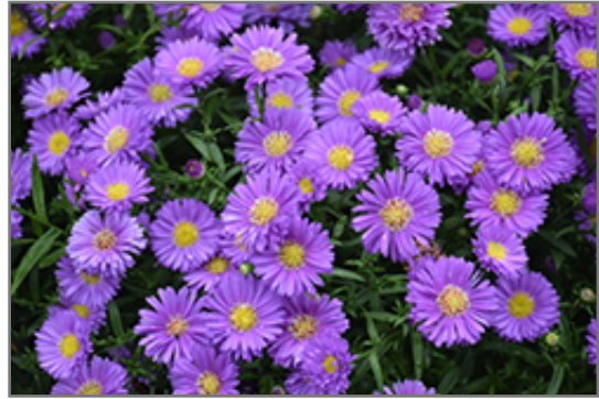
Magic Purple Aster flowers

Magic Purple Aster is recommended for the following landscape applications;