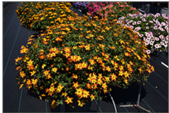
Blazing Glory Bidens in bloom