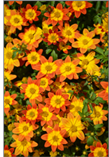
Blazing Glory Bidens flowers

Blazing Glory Bidens is recommended for the following landscape applications;