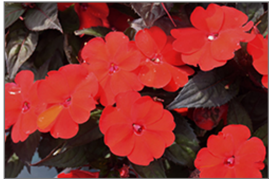
SunPatiens Compact Deep Red Impatiens flowers