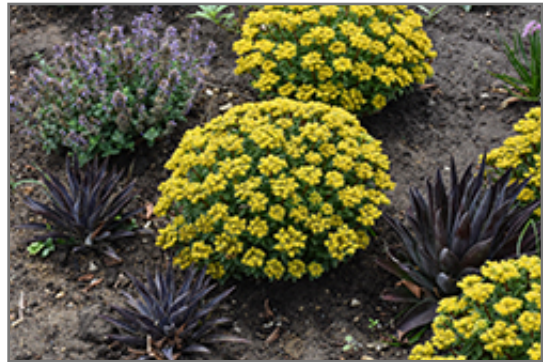
Rock 'N Round Bright Idea Stonecrop in bloom