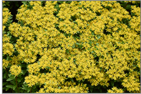
Rock 'N Round Bright Idea Stonecrop flowers

Rock 'N Round Bright Idea Stonecrop is a dense herbaceous perennial with a mounded form. Its medium texture blends into the garden, but can always be balanced by a couple of finer or coarser plants for an effective composition.