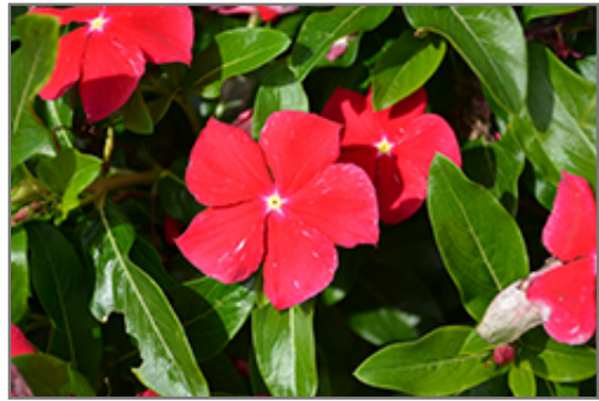
Cora XDR Red Vinca flowers

Cora XDR Red Vinca is recommended for the following landscape applications;