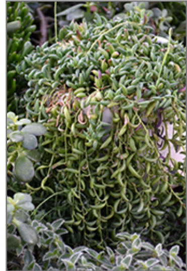
String of Bananas

This is an herbaceous evergreen houseplant with a trailing habit of growth, eventually spilling over the edges of hanging baskets and containers. Its relatively fine texture sets it apart from other indoor plants with less refined foliage. This plant usually looks its best without pruning, although it will tolerate pruning.