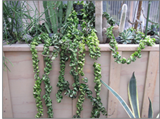
Hindu Rope Plant

When grown indoors, Hindu Rope Plant can be expected to grow to be about 12 inches tall at maturity, with a spread of 3 feet. It grows at a medium rate, and under ideal conditions can be expected to live for approximately 10 years. This houseplant should be situated in a location that gets indirect sunlight at most, although it will usually require a more brightly-lit environment than what artificial indoor lighting alone can provide. It is very adaptable to both dry and moist soil, but will not tolerate any standing water. The surface of the soil shouldn't be allowed to dry out completely, and so you should expect to water this plant once and possibly even twice each week. Be aware that your particular watering schedule may vary depending on its location in the room, the pot size, plant size and other conditions; if in doubt, ask one of our experts in the store for advice. It is particular about its soil conditions, with a strong preference for rich, acidic soil. Contact the store for specific recommendations on pre-mixed potting soil for this plant.