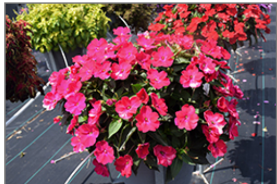
SunPatiens Compact Rose Glow New Guinea Impatiens in bloom