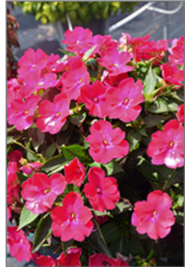
SunPatiens Compact Rose Glow New Guinea Impatiens flowers

SunPatiens Compact Rose Glow New Guinea Impatiens is a fine choice for the garden, but it is also a good selection for planting in outdoor containers and hanging baskets. It can be used either as 'filler' or as a 'thriller' in the 'spiller-thriller-filler' container combination, depending on the height and form of the other plants used in the container planting. It is even sizeable enough that it can be grown alone in a suitable container. Note that when growing plants in outdoor containers and baskets, they may require more frequent waterings than they would in the yard or garden.