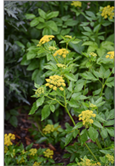
Golden Alexander flowers

Golden Alexander is recommended for the following landscape applications;