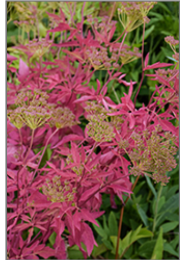
Golden Alexander in fall

Golden Alexander is a fine choice for the garden, but it is also a good selection for planting in outdoor pots and containers. With its upright habit of growth, it is best suited for use as a 'thriller' in the 'spiller-thriller-filler' container combination; plant it near the center of the pot, surrounded by smaller plants and those that spill over the edges. It is even sizeable enough that it can be grown alone in a suitable container. Note that when growing plants in outdoor containers and baskets, they may require more frequent waterings than they would in the yard or garden.