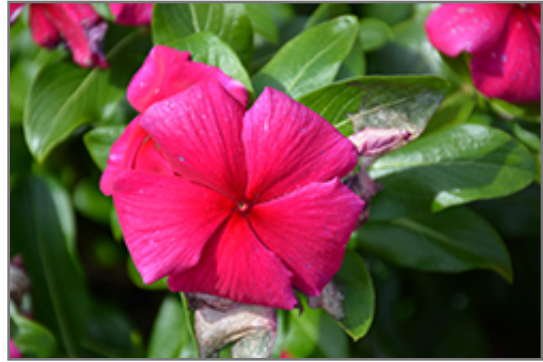
Cora XDR Hotgenta flowers

Cora XDR Hotgenta will grow to be about 16 inches tall at maturity, with a spread of 20 inches. Its foliage tends to remain dense right to the ground, not requiring facer plants in front. This fast-growing annual will normally live for one full growing season, needing replacement the following year.