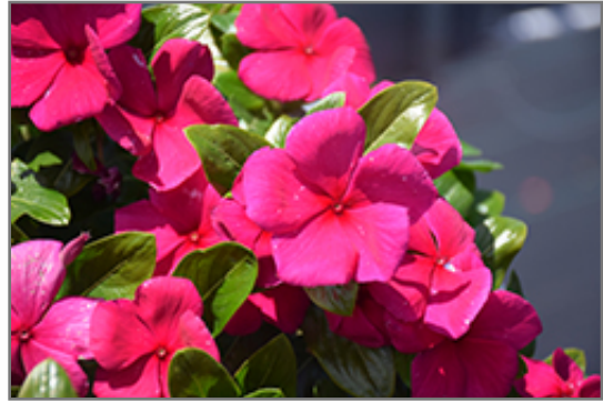
Cora XDR Hotgenta flowers

Cora XDR Hotgenta is recommended for the following landscape applications;