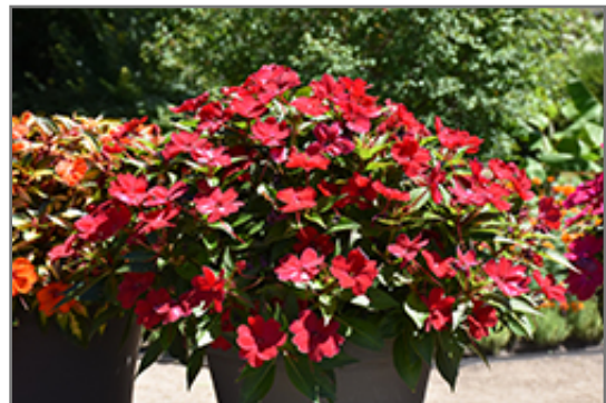
SunPatiens Vigorous Red Impatiens in bloom