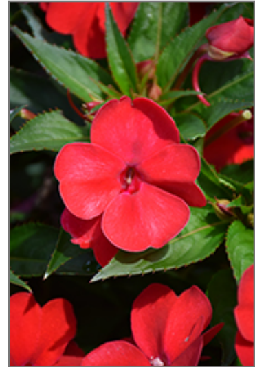
SunPatiens Vigorous Red Impatiens flowers

SunPatiens Vigorous Red Impatiens is a fine choice for the garden, but it is also a good selection for planting in outdoor containers and hanging baskets. Because of its height, it is often used as a 'thriller' in the 'spiller-thriller-filler' container combination; plant it near the center of the pot, surrounded by smaller plants and those that spill over the edges. It is even sizeable enough that it can be grown alone in a suitable container. Note that when growing plants in outdoor containers and baskets, they may require more frequent waterings than they would in the yard or garden.