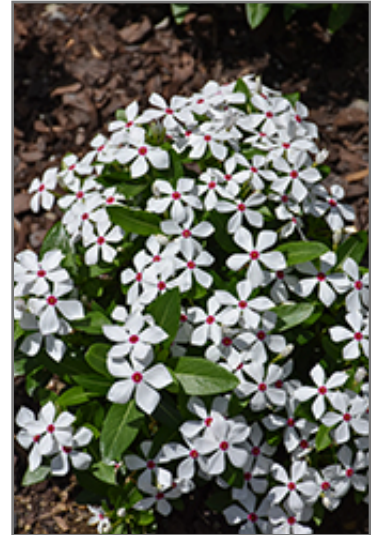
Soiree Kawaii White Peppermint Vinca flowers

Soiree Kawaii White Peppermint Vinca is recommended for the following landscape applications;