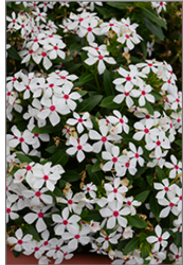
Soiree Kawaii White Peppermint Vinca flowers

Soiree Kawaii White Peppermint Vinca is a fine choice for the garden, but it is also a good selection for planting in outdoor containers and hanging baskets. Because of its trailing habit of growth, it is ideally suited for use as a 'spiller' in the 'spiller-thriller-filler' container combination; plant it near the edges where it can spill gracefully over the pot. Note that when growing plants in outdoor containers and baskets, they may require more frequent waterings than they would in the yard or garden.