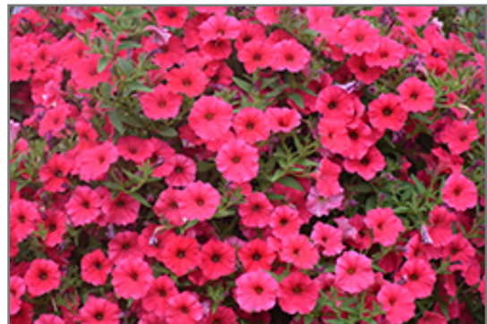
Supertunia Vista Paradise Petunia flowers