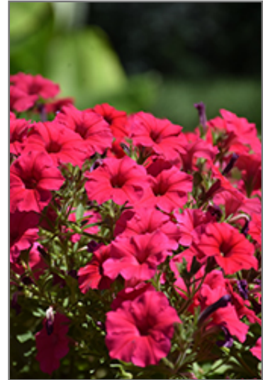
Supertunia Vista Paradise Petunia flowers

Supertunia Vista Paradise Petunia is a dense herbaceous annual with a trailing habit of growth, eventually spilling over the edges of hanging baskets and containers. Its medium texture blends into the garden, but can always be balanced by a couple of finer or coarser plants for an effective composition.