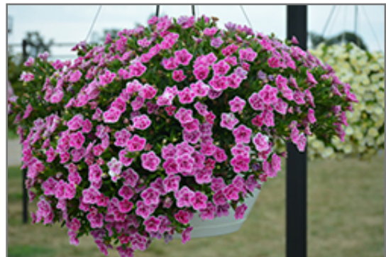
Superbells Doublette Love Swept Calibrachoa in bloom