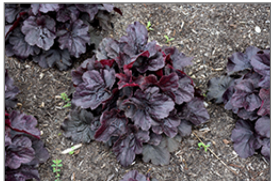
Northern Exposure Black Coral Bells