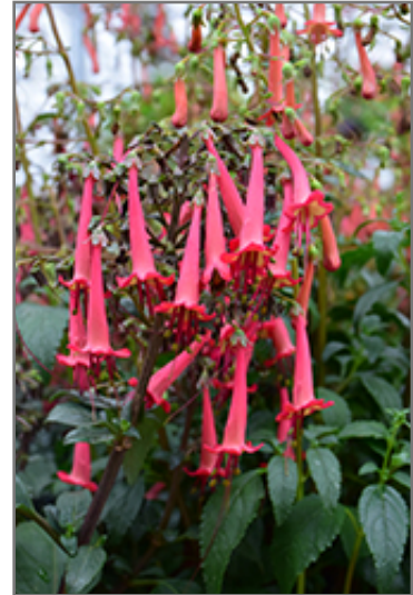
COLORBURST Deep Red Cape Fuchsia flowers