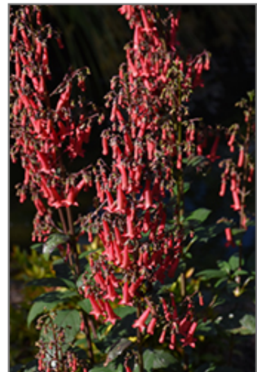
COLORBURST Deep Red Cape Fuchsia flowers