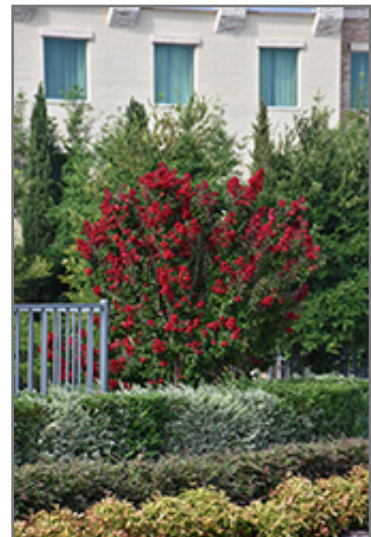
Double Dynamite Crapemyrtle in bloom