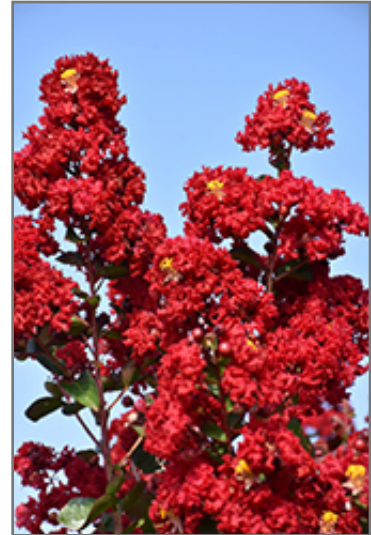
Double Dynamite Crapemyrtle flowers

This shrub does best in full sun to partial shade. It prefers to grow in average to moist conditions, and shouldn't be allowed to dry out. It is very fussy about its soil conditions and must have rich, acidic soils to ensure success, and is subject to chlorosis (yellowing) of the foliage in alkaline soils. It is highly tolerant of urban pollution and will even thrive in inner city environments. This is a selected variety of a species not originally from North America.