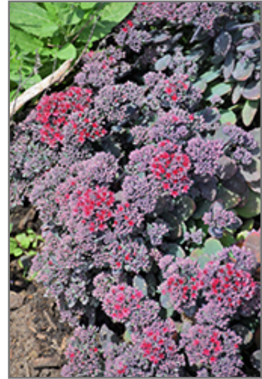
Rock 'N Grow Superstar Stonecrop flower buds

Rock 'N Grow Superstar Stonecrop is a dense herbaceous perennial with a mounded form. Its medium texture blends into the garden, but can always be balanced by a couple of finer or coarser plants for an effective composition.