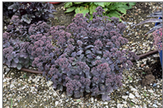
Rock 'N Grow Superstar Stonecrop in bloom