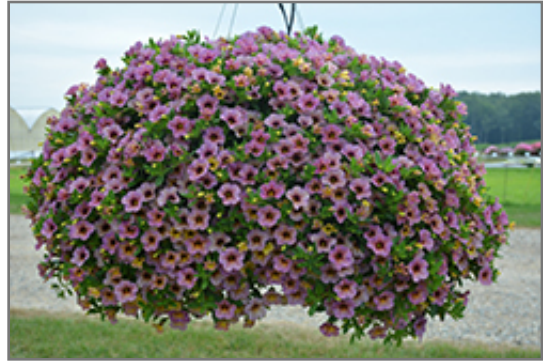
Chameleon Blueberry Scone Calibrachoa in bloom