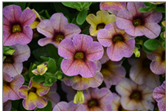
Chameleon Blueberry Scone Calibrachoa flowers