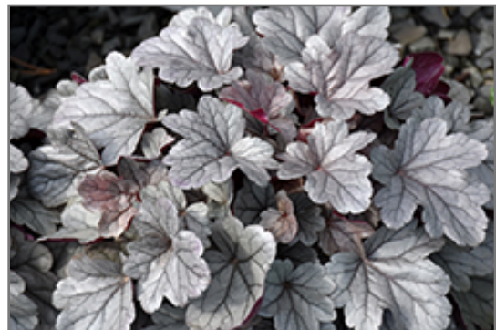
Dolce Silver Gumdrop Coral Bells