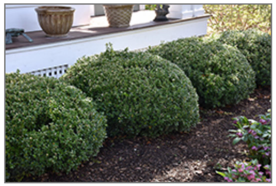
Sprinter Boxwood

This shrub does best in full sun to partial shade. You may want to keep it away from hot, dry locations that receive direct afternoon sun or which get reflected sunlight, such as against the south side of a white wall. It prefers to grow in average to moist conditions, and shouldn't be allowed to dry out. It is not particular as to soil type or pH. It is highly tolerant of urban pollution and will even thrive in inner city environments, and will benefit from being planted in a relatively sheltered location. This is a selected variety of a species not originally from North America.