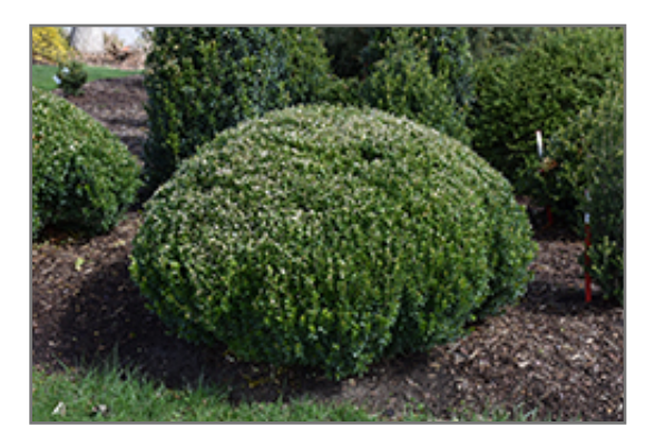
Sprinter Boxwood

Sprinter Boxwood is recommended for the following landscape applications;