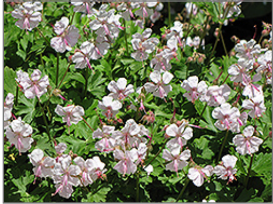
Biokovo Cranesbill in bloom

Biokovo Cranesbill will grow to be about 8 inches tall at maturity, with a spread of 18 inches. When grown in masses or used as a bedding plant, individual plants should be spaced approximately 15 inches apart. Its foliage tends to remain low and dense right to the ground. It grows at a medium rate, and under ideal conditions can be expected to live for approximately 10 years. As an evergreen perennial, this plant will typically keep its form and foliage year-round.