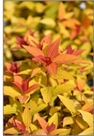
Double Play Candy Corn Spirea foliage

Double Play Candy Corn Spirea is recommended for the following landscape applications;