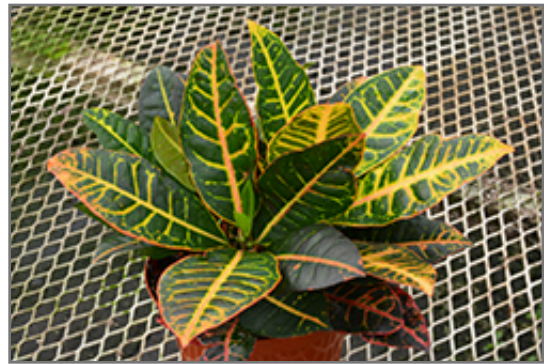
Petra Variegated Croton in full