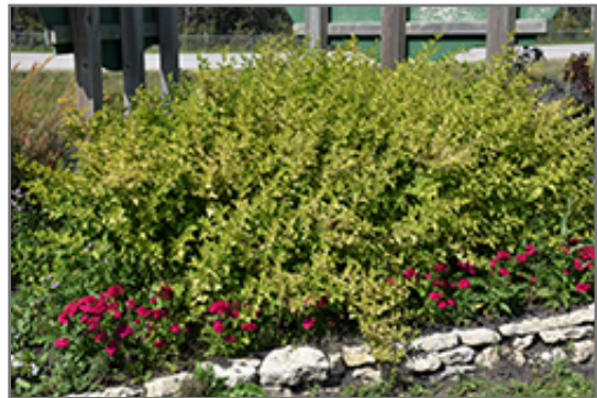
Festivus Gold Ninebark