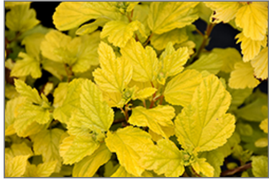
Festivus Gold Ninebark foliage

This shrub does best in full sun to partial shade. It is very adaptable to both dry and moist locations, and should do just fine under average home landscape conditions. It is not particular as to soil type or pH. It is highly tolerant of urban pollution and will even thrive in inner city environments. This is a selection of a native North American species.