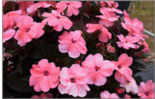
SunPatiens Compact Coral Pink New Guinea Impatiens flowers

This plant will require occasional maintenance and upkeep, and should not require much pruning, except when necessary, such as to remove dieback. It is a good choice for attracting bees and butterflies to your yard. It has no significant negative characteristics.