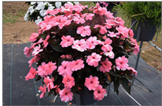
SunPatiens Compact Coral Pink New Guinea Impatiens in bloom