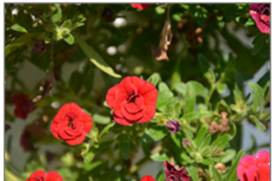
MiniFamous Double Compact Red Calibrachoa flowers