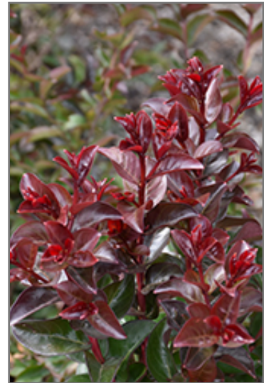
Cherry Mocha Crapemyrtle foliage

Cherry Mocha Crapemyrtle makes a fine choice for the outdoor landscape, but it is also well-suited for use in outdoor pots and containers. With its upright habit of growth, it is best suited for use as a 'thriller' in the 'spiller-thriller-filler' container combination; plant it near the center of the pot, surrounded by smaller plants and those that spill over the edges. It is even sizeable enough that it can be grown alone in a suitable container. Note that when grown in a container, it may not perform exactly as indicated on the tag - this is to be expected. Also note that when growing plants in outdoor containers and baskets, they may require more frequent waterings than they would in the yard or garden.