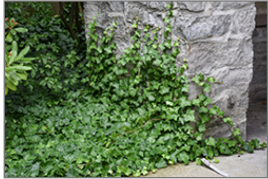
English Ivy

English Ivy makes a fine choice for the outdoor landscape, but it is also well-suited for use in outdoor pots and containers. Because of its spreading habit of growth, it is ideally suited for use as a 'spiller' in the 'spiller-thriller-filler' container combination; plant it near the edges where it can spill gracefully over the pot. Note that when grown in a container, it may not perform exactly as indicated on the tag - this is to be expected. Also note that when growing plants in outdoor containers and baskets, they may require more frequent waterings than they would in the yard or garden.