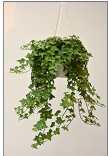
English Ivy