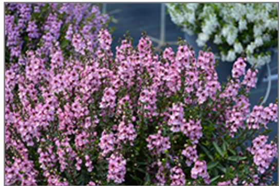
Serenita Pink Angelonia in bloom