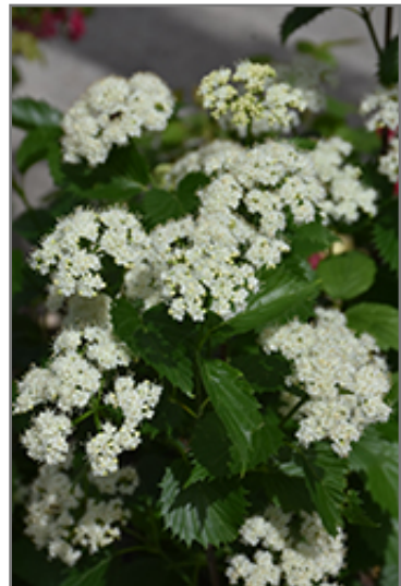
Blue Muffin Viburnum flowers