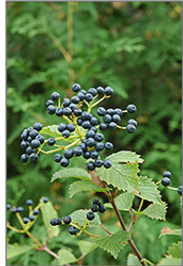
Blue Muffin Viburnum fruit

Blue Muffin Viburnum is recommended for the following landscape applications;