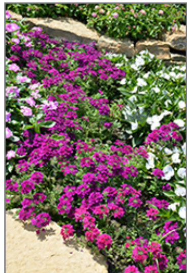
Superbena Royale Plum Wine Verbena in bloom