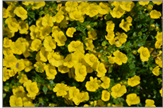
Gold Dust Mecardonia flowers

Gold Dust Mecardonia will grow to be only 4 inches tall at maturity, with a spread of 15 inches. When grown in masses or used as a bedding plant, individual plants should be spaced approximately 12 inches apart. Its foliage tends to remain low and dense right to the ground. Although it's not a true annual, this fast-growing plant can be expected to behave as an annual in our climate if left outdoors over the winter, usually needing replacement the following year. As such, gardeners should take into consideration that it will perform differently than it would in its native habitat.